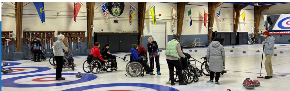
Try Wheelchair curling event hosted at the Cricket Club - March 2025